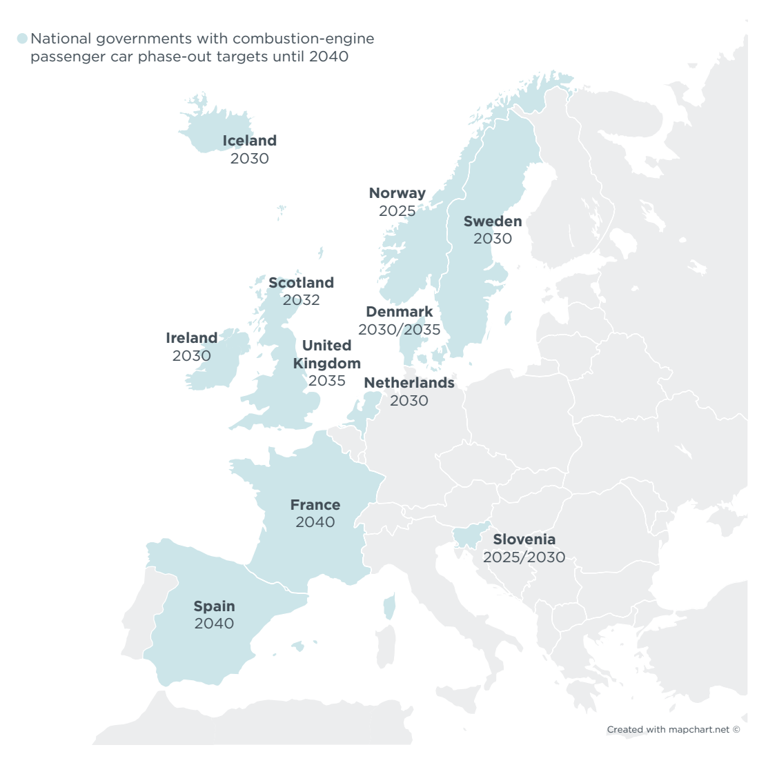
Figure 1. Select national government targets for phasing out combustion-engine cars up to 2040 as of April 2020.

In addition to national goals to decarbonize vehicle fleets, EU member states are also required to report climate and energy objectives, targets, policies, and measures to the European Commission in the form of a 10-year integrated National Energy and Climate Plan (NECP) for 2021–2030. The final versions were to be submitted by December 2019. Out of 27 EU Member States, 23 provided final NECPs by the end of April 2020, of which only Denmark, France, and Spain mention the end of the sale of all new combustion engine cars by 2030 and 2040, respectively. However, Ireland and the United Kingdom also planned to bar sales of non-zero-emission cars in their draft NECPs submitted in early 2019. Romania proposed in its final plan dated January 2020 to prohibit the registration of vehicles with Euro 3 and Euro 4 emission standards without mentioning a date. <sup>23</sup>