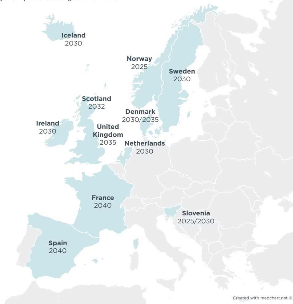
Figure 1. Select national government targets for phasing out combustion-engine cars up to 2040 as of April 2020.

● National governments with combustion-engine passenger car phase-out targets until 2040