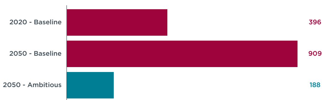
Figure 1. Estimated well-to-wheel CO 2 emissions from cars, vans, buses, and trucks in Africa (million tonnes CO 2 per year)

Africa accounted for only 3% of the global new vehicle market in 2020, but imports of used vehicles and a growing vehicle fleet are fueling increases in climate emissions and air quality impacts in the region. According to the report “Used Vehicles and the Environment,” 1 about 1.5 million used vehicles are imported into Africa every year. Transport sector demand for fossil fuels grew by almost 50% between 2010 and 2020. 2 As Figure 1 shows, under currently adopted policies (Baseline scenario), well-to-wheel CO 2 emissions from vehicles (excluding 2&3-wheelers) will reach 909 million tonnes in 2050, 2.3 times the 2020 level. An accelerated transition to zero-emission vehicles (ZEVs 3 ) in the region could instead reduce CO 2 emissions to 53% below the 2020 level by 2050 (Ambitious scenario).