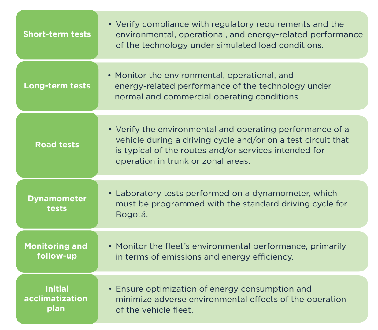
Figure 2. Description of the types of tests provided for in the PAT.<sup>5</sup>

As noted above, the PAT envisions the development of a methodological guide for testing zero- and low-emission technologies implemented within the SITP. This guide is part of the Bogotá D.C. city laboratory line of action. A summary of such tests appears in Figure 2 below.