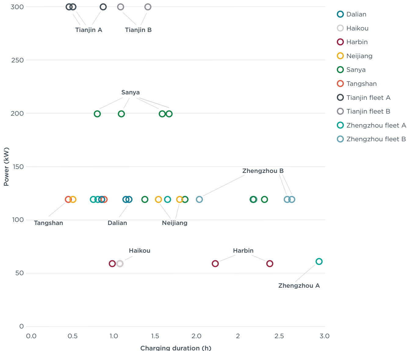
Charging power and average charging duration of e-bus fleets in different cities

Note: Each dot represents one bus model of the respective fleet.