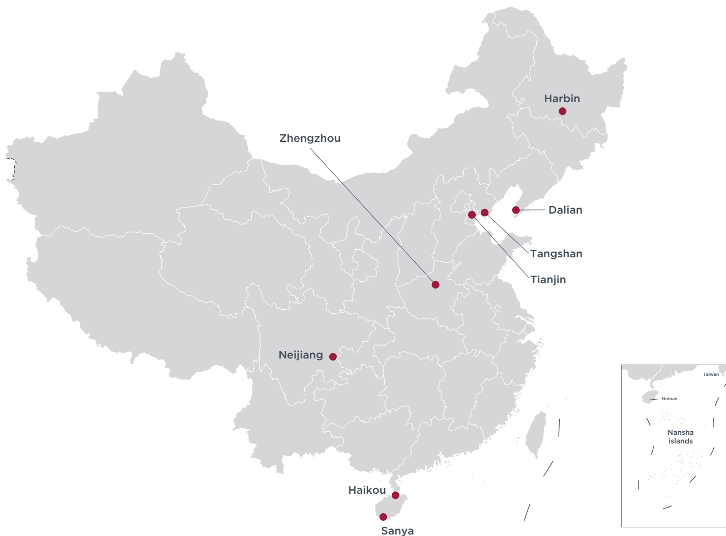
Figure 1 Geographical spread of the bus fleets in this study

THE INTERNATIONAL COUNCIL ON CLEAN TRANSPORTATION THEICCT.ORG